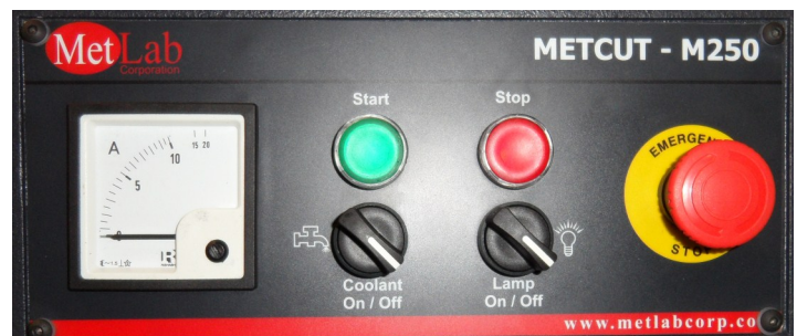
METCUT—M250 FRONT PANEL